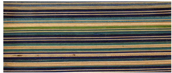
sku 6351 • 4.24 x 10